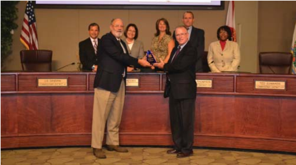
Congratulations to Orange County, recipient of the Gold 2011 Landfill Gas Utilization Excellence Award.

have been secured and the contract for the sale of electricity to FPL is expected to be executed before the end of the year. The final Order to Proceed is scheduled for issuance in April, 2012 when construction will commence. Completion is currently scheduled for May, 2015.