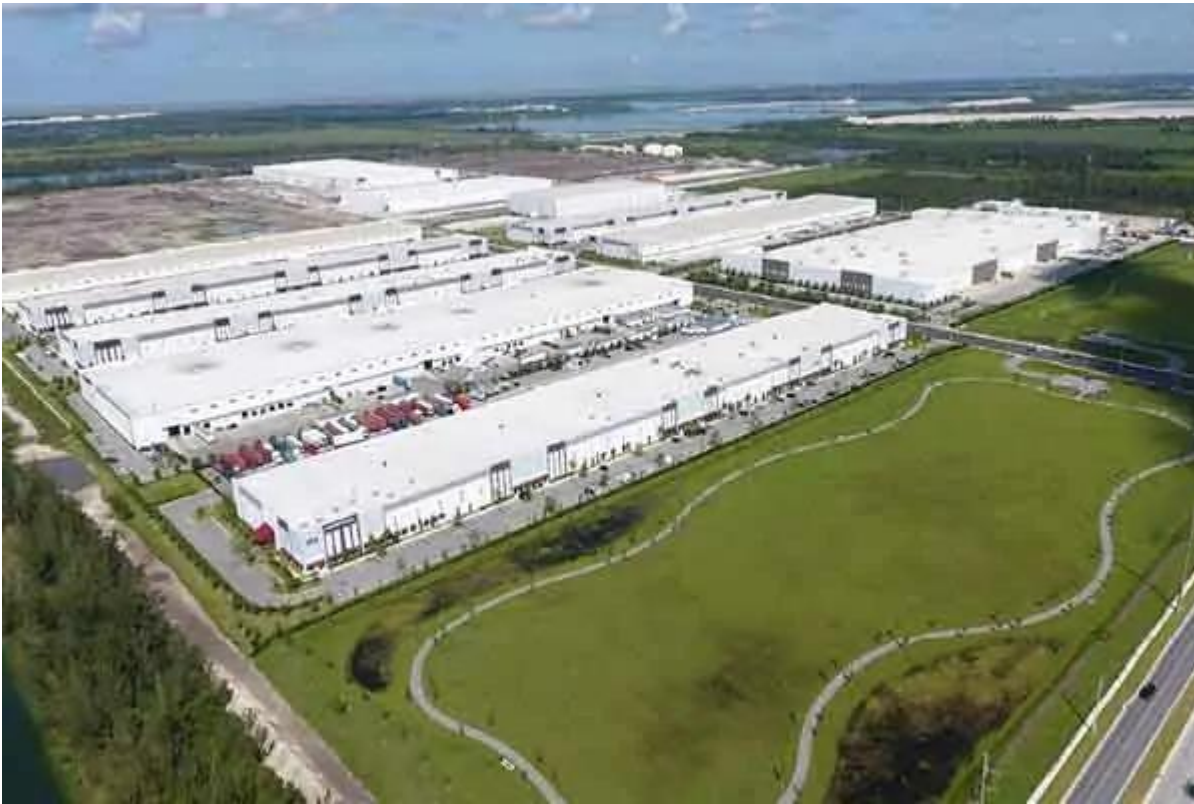
500-acre former landfill site. Countyline Corporate Park in SE Florida.

Brownfields Projects- $1.2 billion, Summer/Fall 2022