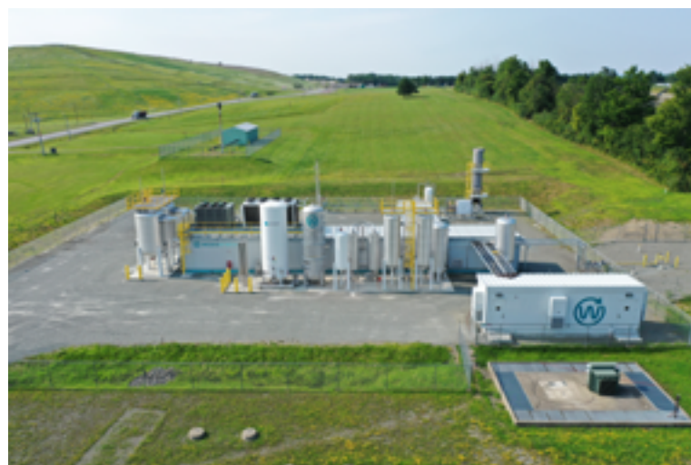
Every WAGABOX® unit uses a proprietary low-pressure cryogenic distillation process.

Functionally, renewable natural gas is a low-carbon drop-in replacement for fossil fuel natural gas. Every unit of landfill gas energy upgraded to renewable natural gas displaces an equivalent unit of higher carbon fossil fuel natural gas. Renewable natural gas derived from landfills can be used