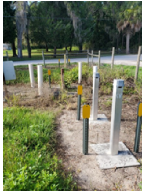
A well-designed monitoring network supports spatial and vertical data review, helping translate data into meaningful site narratives that reveal potential impacts, system inefficiencies, or maintenance needs.