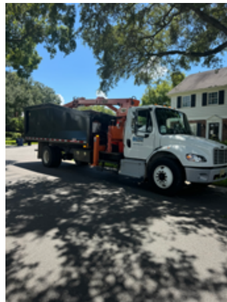
Grapple truck removing debris.

Historical storm data, floodplain maps, and vegetation density models can help predict where and how much debris may accumulate. Municipalities