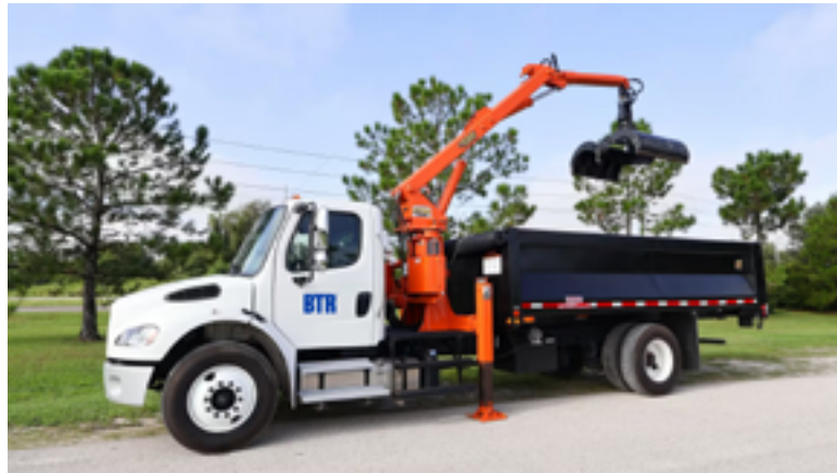
BTR grapple truck.

Each year, storm season tests the resilience and readiness of communities, particularly in regions prone to hurricanes, tornadoes, and severe weather events. While emergency response efforts often focus on power restoration and infrastructure repair, an equally critical aspect is managing the sheer volume of debris that storms leave behind.