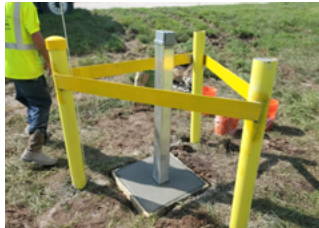
Access to reliable monitoring infrastructure enables consistent data collection, allowing for the interpretation of long-term trends and the uncovering of patterns tied to operational infrastructure changes.

When managing landfills, people often treat groundwater monitoring as a compliance requirement, a box to check and file. If that is all you are doing, you are missing a major opportunity to gain insight into your landfill. Groundwater is more than a regulatory requirement; it is one of the most powerful tools for understanding your landfill's performance and